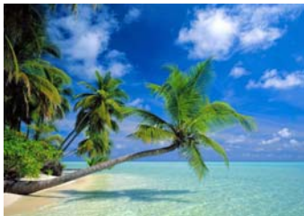
You could be here!

The Grand prize of two round trip tickets to Hawaii seems to have folks up and walking and changing their diets to loose those extra pounds they gained over the Winter.