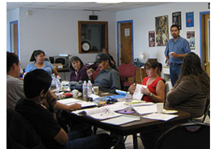
Board of Director's Meeting, July 2009